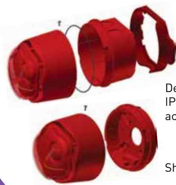
Deep base with IP66 mounting accessory