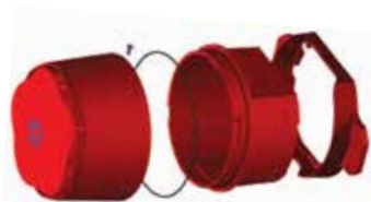
Deep base with IP66 mounting accessory