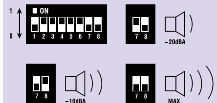
Sound selection 1 to 5, output level 7 & 8, 6 not used